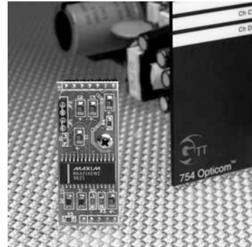
Opticom™ Model 832 Communications Daughter Board