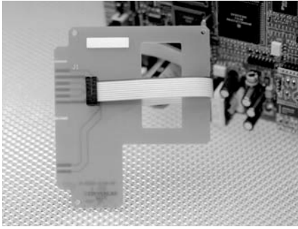
Opticom™ Model 755 Four-Channel Adapter Card