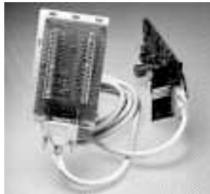
Opticom™ Model 758 Auxiliary Interface Panel