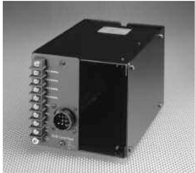
Opticom™ Model 760E Card Rack