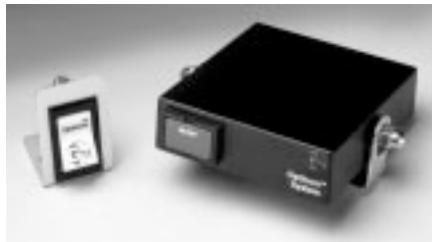
Opticom™ Model 793B Switch (left) and Opticom™ Model 793S Switch (right)